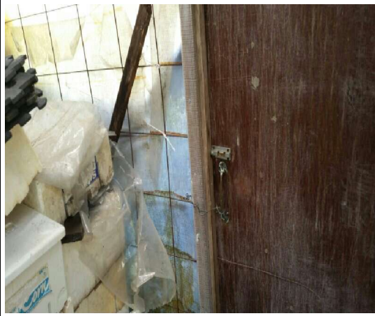
GREENHOUSE & DOOR AT SIDE OF HOUSE.